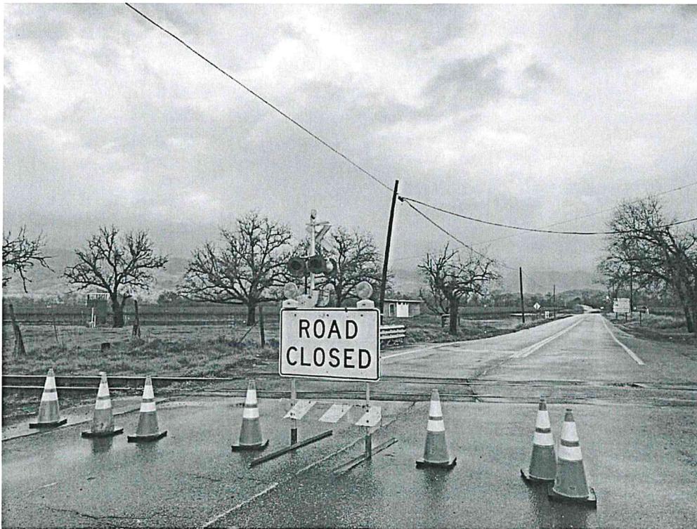
S.R. 175 closed at Highway 101 on due to Russian River flooding January 5, 2023.

This is a developing situation and information may change. We'll update this article as more information becomes available. The most recent information will be updated at the top of the article, with the earlier reports below.