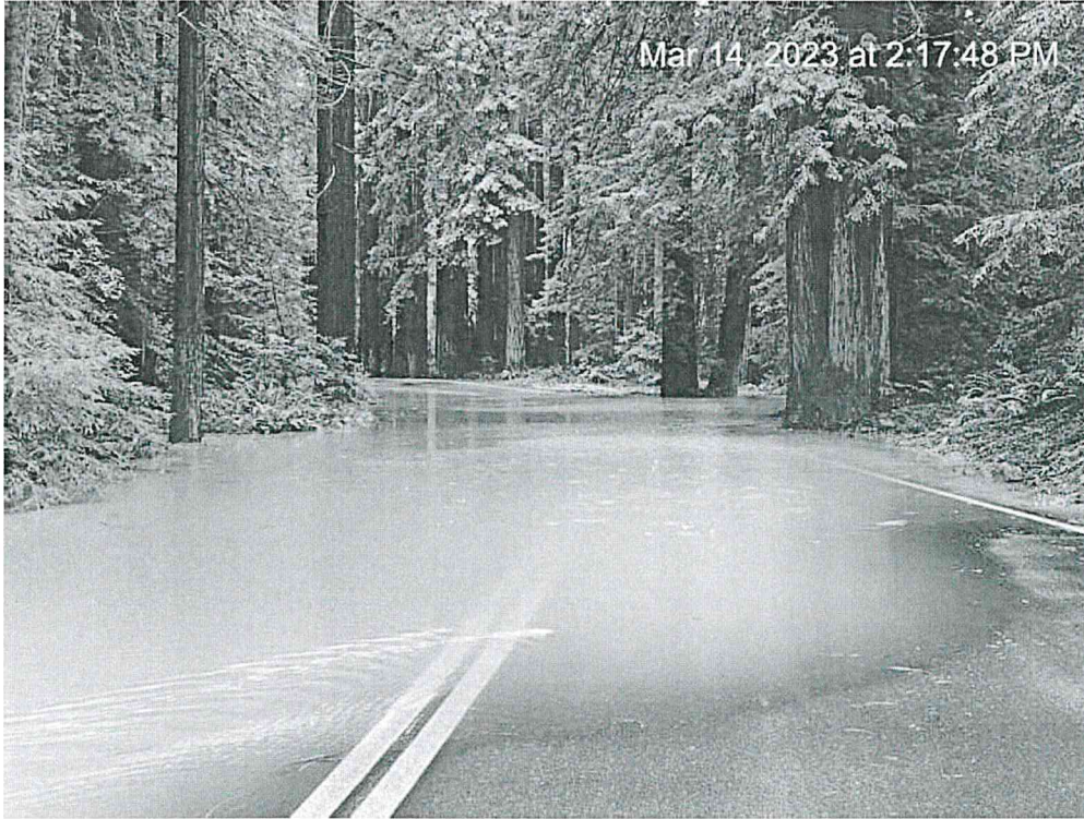
A flooded State Route 128 in Navarro on Mar. 14, 2023.

hcmacid=aoj3m00000Dzw19&utm_campaign=NCR_MENDO_RECRUITMENT&utm_medium=Print&utm_content=AD_NCR_MENDO_RECRUITMENT_NURSING_300x250)