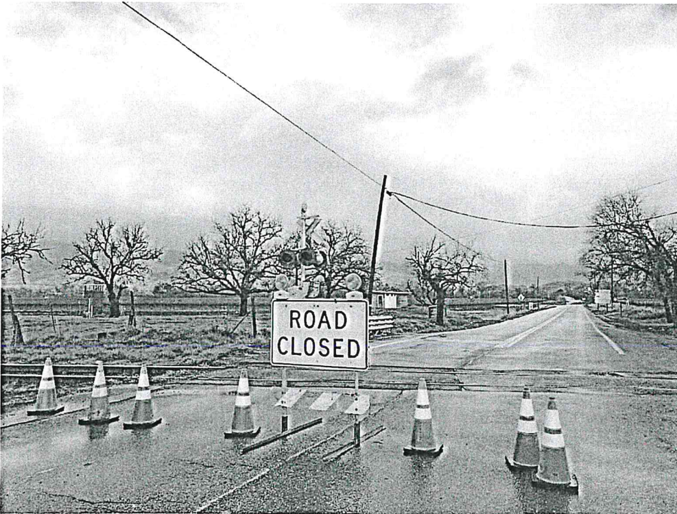
S.R. 175 closed at Highway 101 on due to Russian River flooding January 5, 2023.

This is a developing situation and information may change. We'll update this article as more information becomes available. The most recent information will be updated at the top of the article, with the earlier reports below.