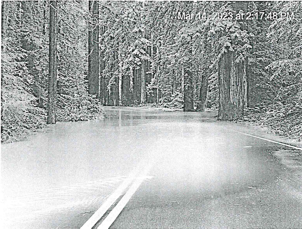
A flooded State Route 128 in Navarro on Mar. 14, 2023.

hcmacid=aoj3m00000Dzw19&utm_campaign=NCR_MENDO_RECRUITMENT&utm_medium=Print&utm_content=AD_NCR_MENDO_RECRUITMENT_NURSING_300x250)